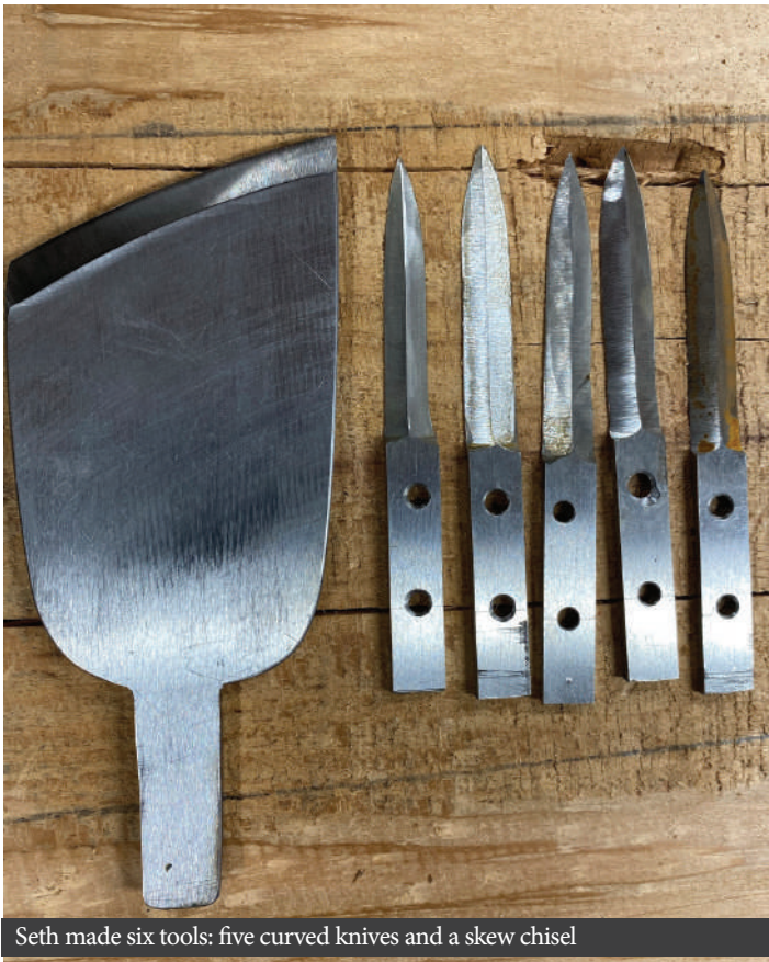
Seth made six tools: five curved knives and a skew chisel